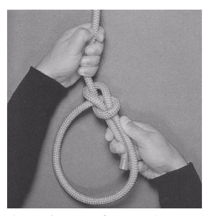
A bowline - see footnote 1.

Annapolis Sailing School one fine summer long ago. I never really understood (appreciated yes, but understood, no) that knot until this very moment when I realize that I can loosen it simply by grabbing the line on either side of the knot and pushing towards it. The stiffer the line, the